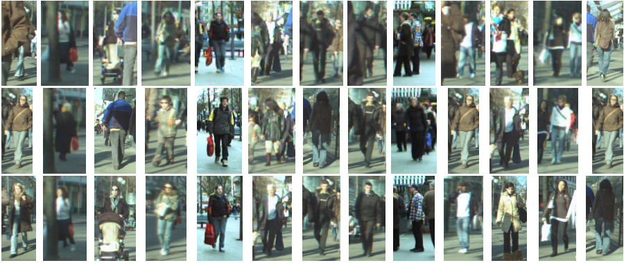
Fig. 4. Identity inference results (SvsAll). First row: test image, second row: incorrect NN result, third row: correct result given by GCIdInf.

three datasets with respect to nearest-neighbor labeling. Our approach permits us to label a large number of unknown images using only few gallery images for each person. For example, on the ETHZ3 dataset we are able to correctly label 1596 out of 1706 test images using only 2 model images per person. The robustness of our method with respect to occlusions and illumination changes is shown in the qualitative results shown in figure 4. The CRF approach proposed yields correct labels even in strongly occluded cases thanks to the neighborhood edges connecting it to less occluded, yet similar, images.