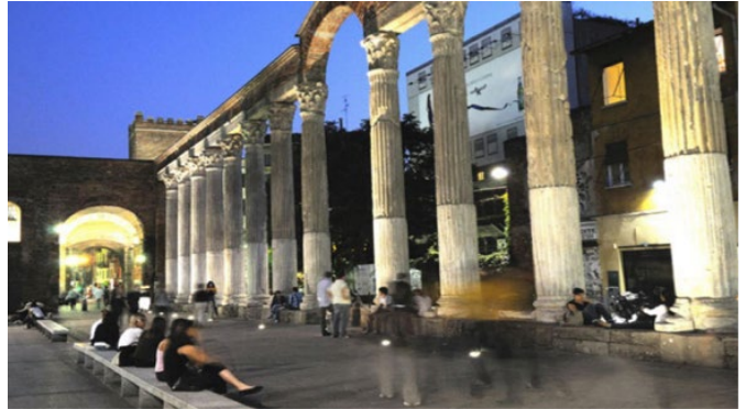
The Diocletian's Roman Thermae ruins