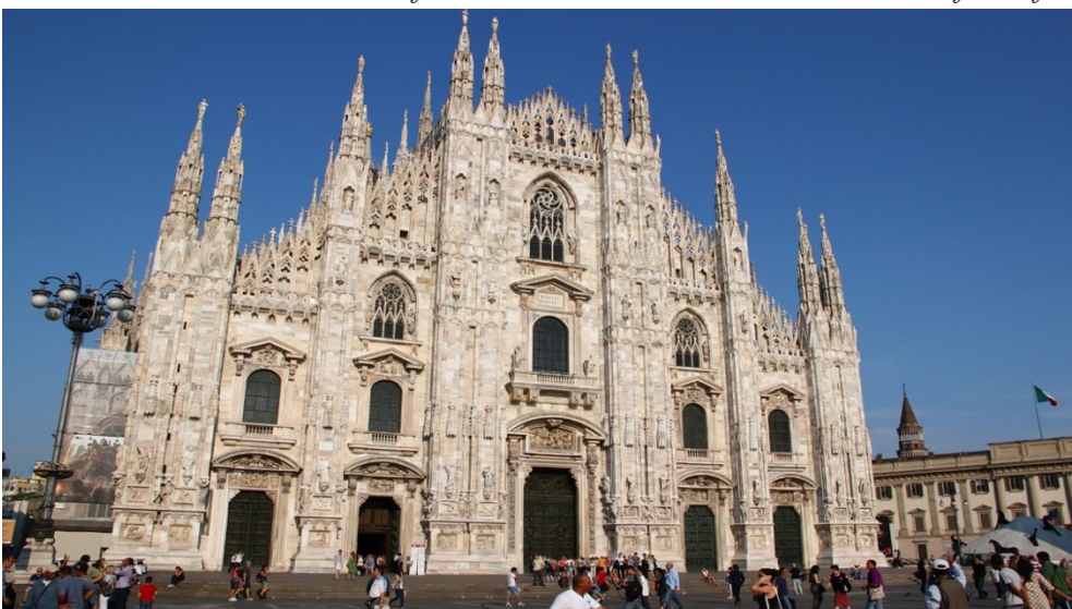
The gothic Cathedral