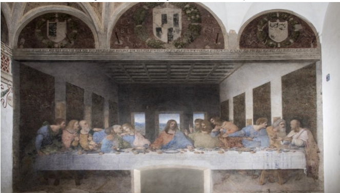
The Leonardo's Ultima Cena fresco