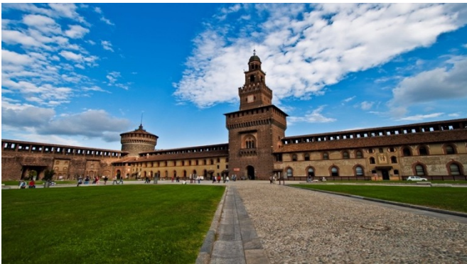
The Castello Sforzesco (Sforza castle)

Milan is the industrial capital of Italy, a modern and vibrant city with a fascinating history dated from the Roman Empire, great monuments of the past and artistic masterpieces, from Roman times, to the Italian Renaissance and modern age. With 2 international airports, it is connected to any city of the world.